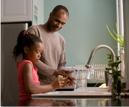
Housing & Homelessness